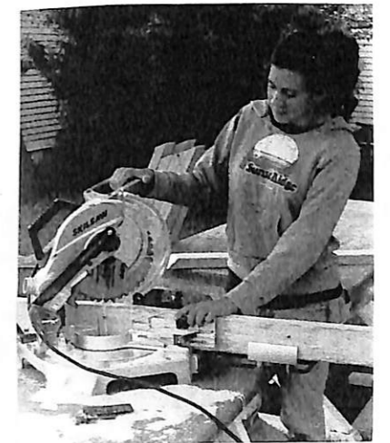
AMBER - STILL DOING CHOP-SAW