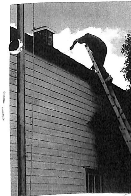
FIXER ON THE ROOF