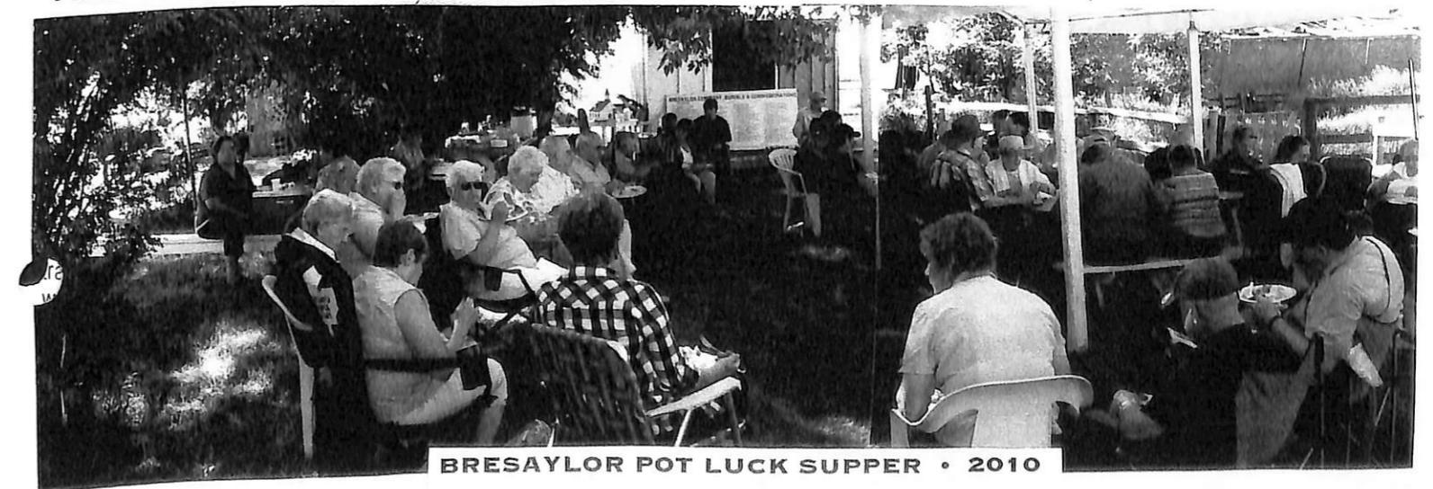
BRESAYLOR POT LUCK SUPPER • 2010