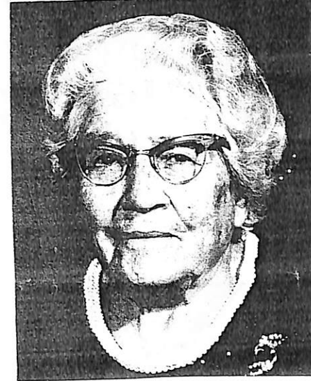
FROM ONE YEAR TO THE NEXT - 2011>>>2012