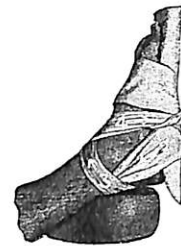
FIG. 52 TREATMENT OF CRUSHED FOOT

• Carol (Bowes) Selte donated to the museum the medicine bag used by her Mother, the late Dorothy Bowes, in her duties as a community nurse. This summer we will try to set up a small exhibit showing items from the medicine bag - syringes, bandages, medications and first aid guides - used by "Nurse Bowes" in her care of the sick and injured in the Bresaylor area.