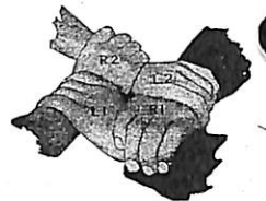
FIG. 80—GRIP FOR FOUR-HANDED SEAT